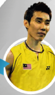
Lee Chong Wei